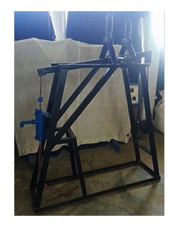
Figure 2: Fabricated pendulum assisted hand water pump.